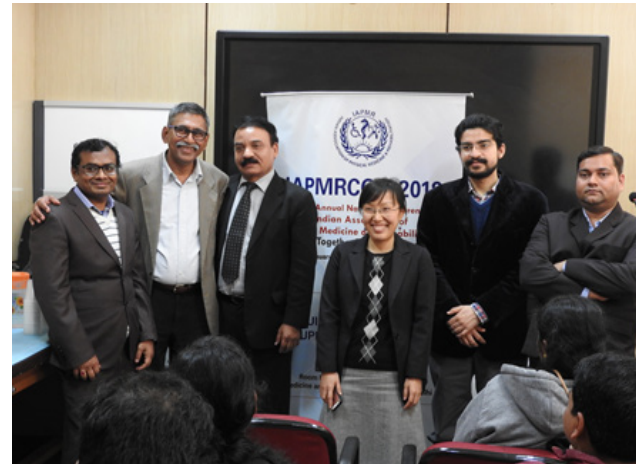
Preconference Workshop (IAPMRCON 2018) on Ultrasound Guided Botulinum Toxin for Upper Limb Spasticity Management at Department of PMR on 18 January 2018